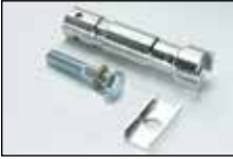
MTP-180 Junior Pin Assembly for Yoke (28mm)