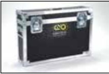
KAS-CE2-Y Celeb 200 Yoke Ship Case