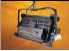
Celeb 200 DMX Pole-Op