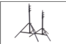
STD-M30 Medium Duty Stand/Black, 30"