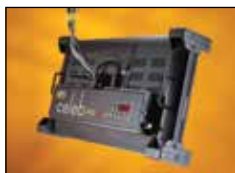
Celeb 200 DMX Center Mount

CEL-200C-120U Celeb 200 DMX Center Mount, Univ 120U