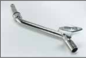
MTP-B41F Kino Offset w/ Baby Receiver (16mm)