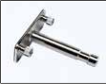
MTP-CE Celeb Support w/ Pin