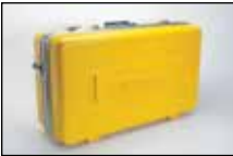
KAS-CE2 Celeb 200 Flight Case