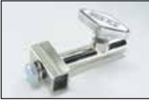
MTP-140 Baby Receiver Assembly for Yoke (16mm)