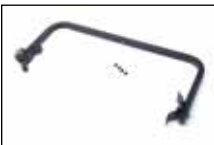
7010032 Celeb 200 Yoke Assembly