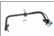
7010038 Celeb 200 Pole-Op Assembly