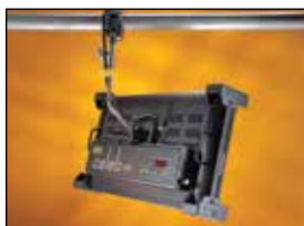
Mounted to pipe grid

The Celeb 200 Center Mount fixture includes a Lollipop w/ Baby Receiver (16mm) ( MTP-LB ) which allows the fixture to be mounted directly onto a baby stand or hung from a grid with a baby pipe clamp.