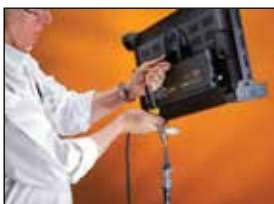
Mounted on a baby stand