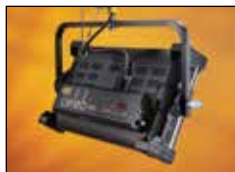
Celeb 200 DMX Yoke Mount

Dimensions: 24 x 14 x 5" (61 x 35.5 x 12.7cm)